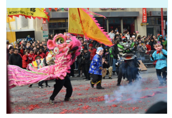
Chinese New Year Parade, Washington, DC